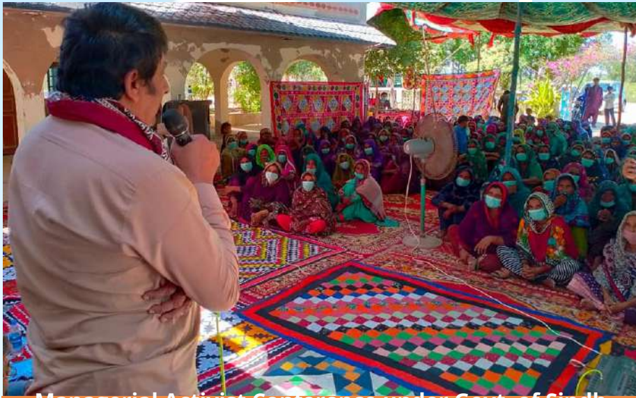
Managerial Activist Conference under Govt. of Sindh funded PPRP

Program Coordinator- PPRP-GoS was the chief guest. Community institutions, beneficiaries and other stakeholders from govt. and CSOs attended the conference